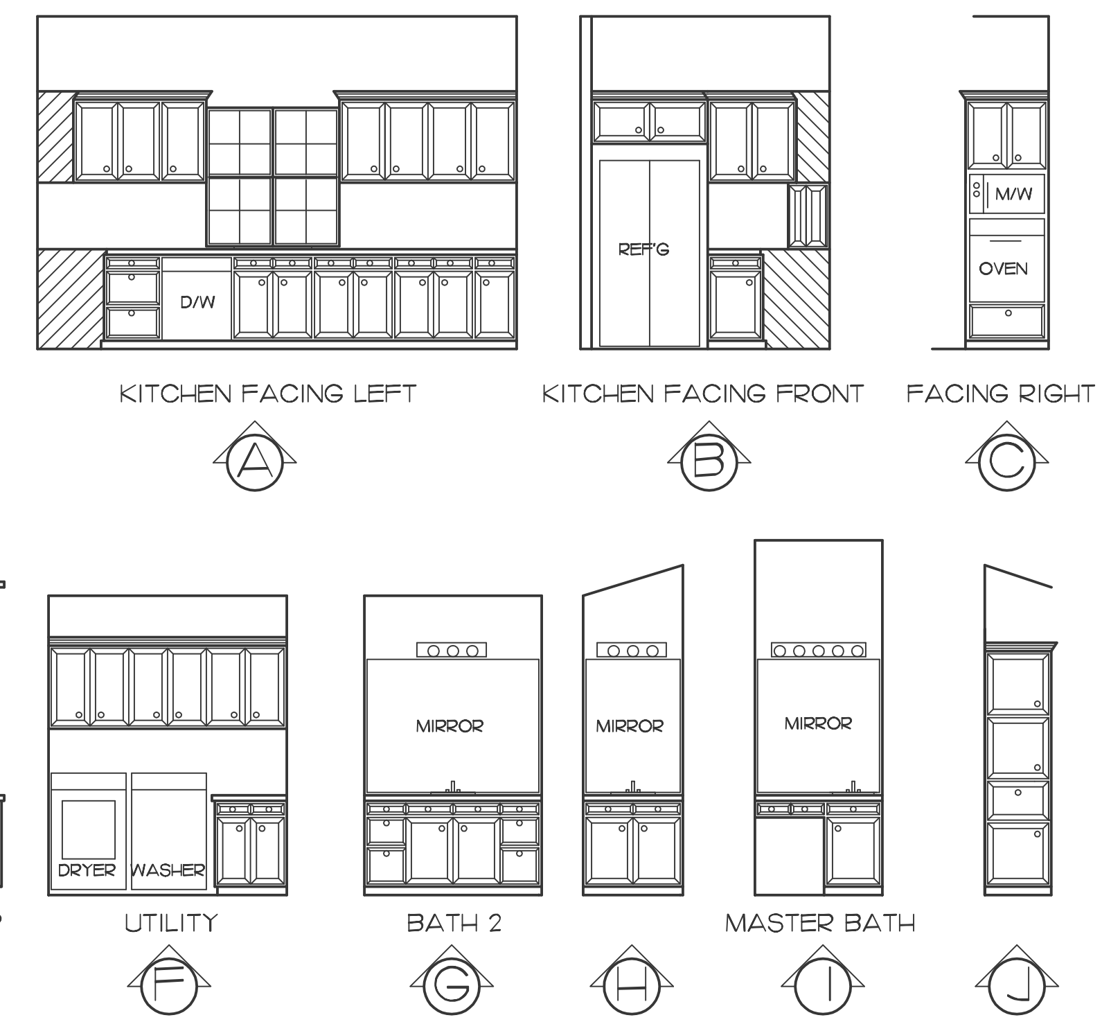
CABINET ELEVATIONS SCALE: 1/4" = 1'-0"